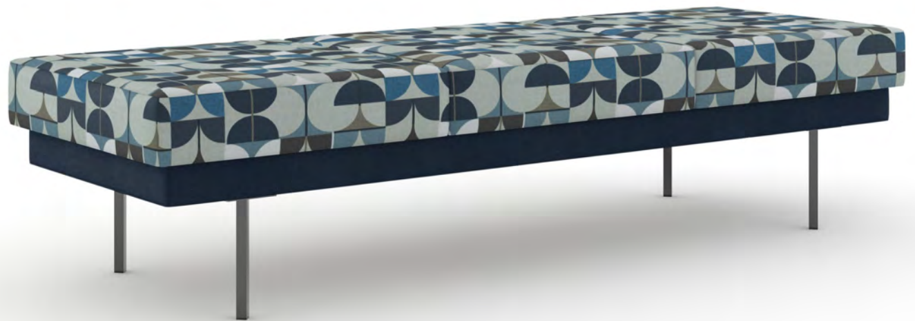
AC64390 Rainstorm #1